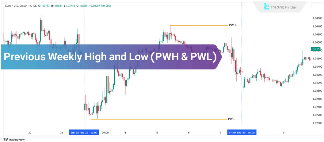
Previous Weekly High (PWH) and Previous Weekly Low (PWL) in Technical Analysis