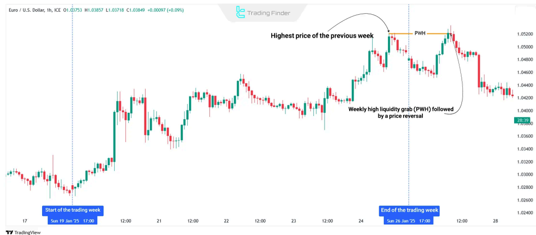
Candlestick chart analysis to identify the Previous Weekly High for the EUR/USD pair on the 1-hour timeframe

Its importance lies in its potential to become a dynamic resistance level , as many sell orders and buy side liquidity (BSL) accumulate in this area.