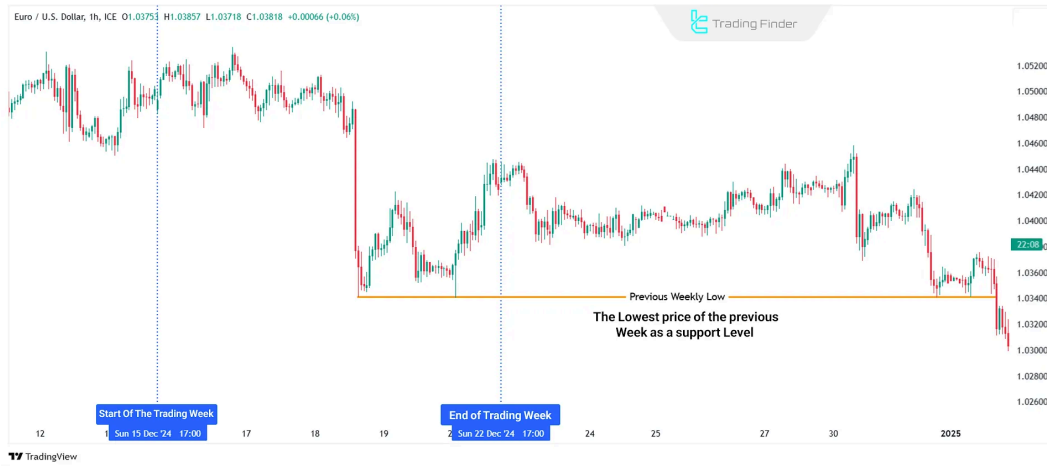
Examining a candlestick chart to identify the Previous Weekly Low for the EUR/USD pair on the 1-hour timeframe