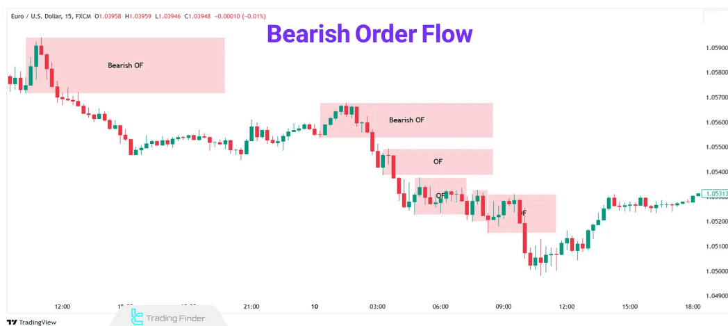
Identifying Bearish Order Flow on EUR/USD 15min Chart