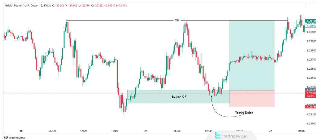
Trading Based on Bullish Order Flow on GBP/USD 15min Chart

The example below illustrates this process: