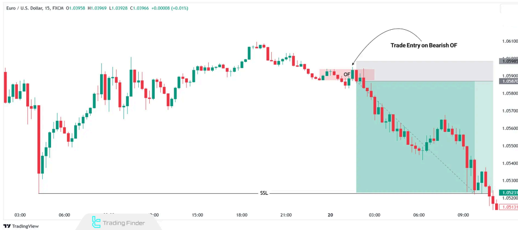
Trading Based on Bearish Order Flow on EUR/USD 15min Chart

The example below illustrates this process: