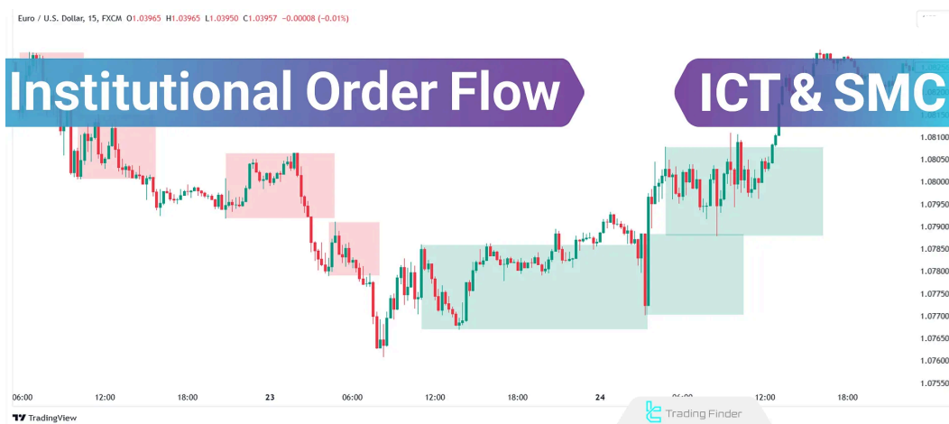
ICT Market Order Flow Trading Guide: Institutional & Smart Money Concept (SMC)

Order Flow (OF) reflects the stream of buy or sell orders from traders, investors, institutions, and other market participants. Ultimately, this flow determines the direction and movement of currency prices in both ICT Style & SMC Strategies .