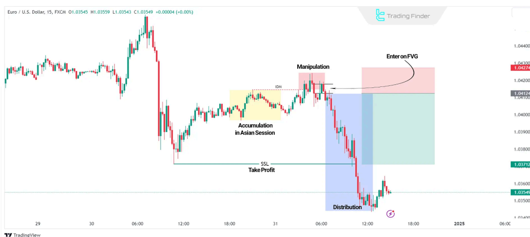
ICT PO3 Trade Setup in the Asian Session on the 15-Minute EUR/USD Chart