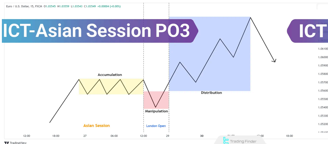
Trading Asian Session Dealing Range Using PO3 Strategy

The ICT Asian Session PO3 strategy emphasizes specific price movement patterns within the Asian trading session , so traders can capitalize on unique opportunities in this timeframe .