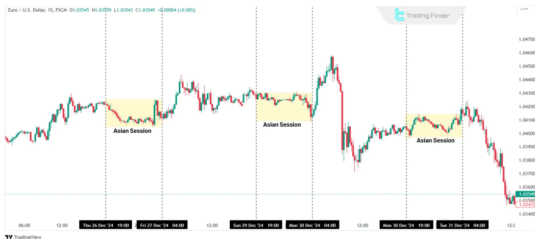
Price Consolidation in the Asian Session (07:00 PM to 04:00 AM NY time)