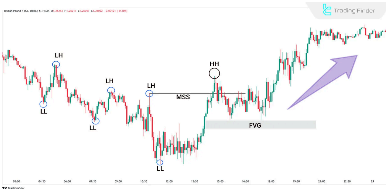
Example of how ICT Daily Bias Setup operates in an uptrend