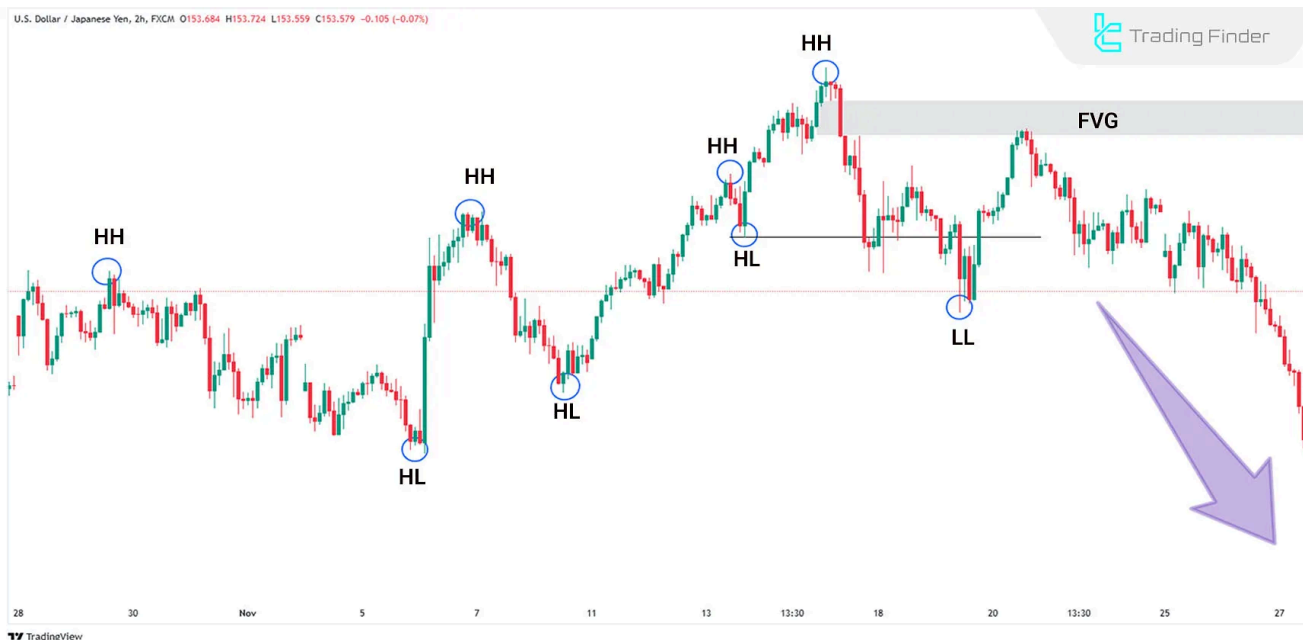
Example of how ICT Daily Bias Setup operates in a downtrend