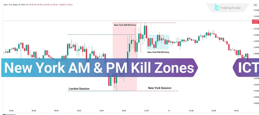
New York AM & PM Kill Zones in ICT Trading Style

New York AM and PM Kill Zones refer to key time periods when volatility and liquidity in the forex market reach their peak.