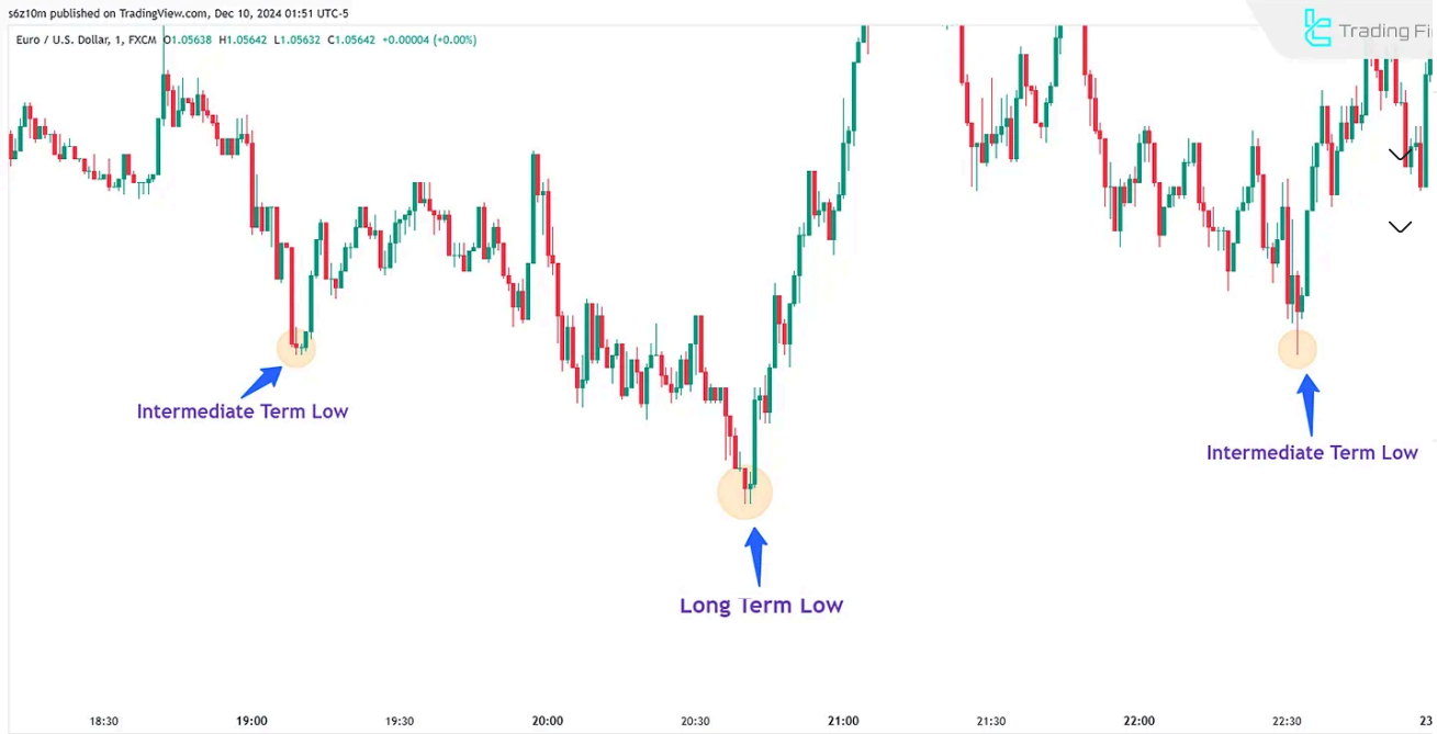
Long Term Low (LTL) between two Intermediate Term Lows (ITL) in Advanced Market Structure trading style