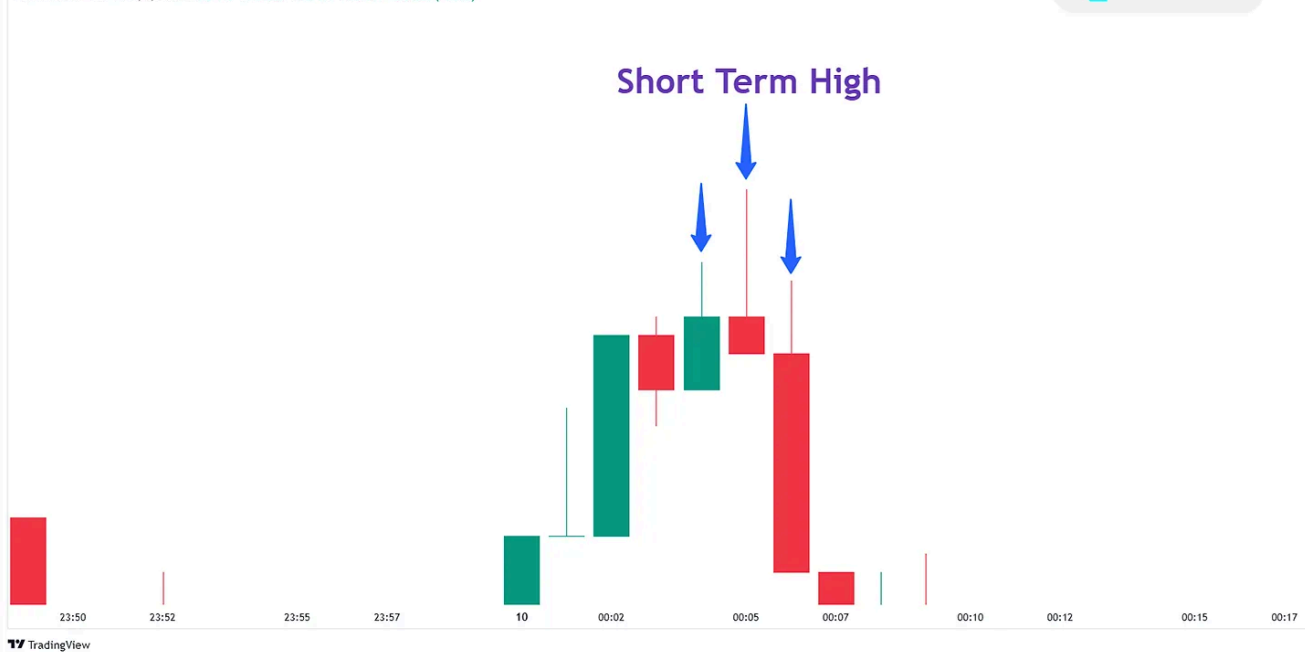
Illustration of a Short Term High (STH) in Advanced Market Structure style

British Pound / U.S. Dollar, 1, FXCM O1.27613 H1.27625 L1.27611 C1.27614 +0.00001 (+0.00%)