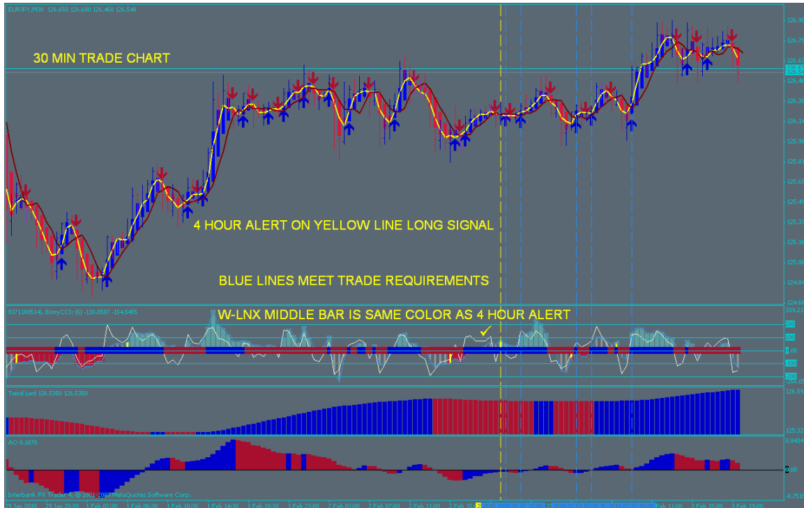
Figure 2 – Provided by TonyB @ http://www.forexfactory.com/showpost.php?p=3427861&postcount=51