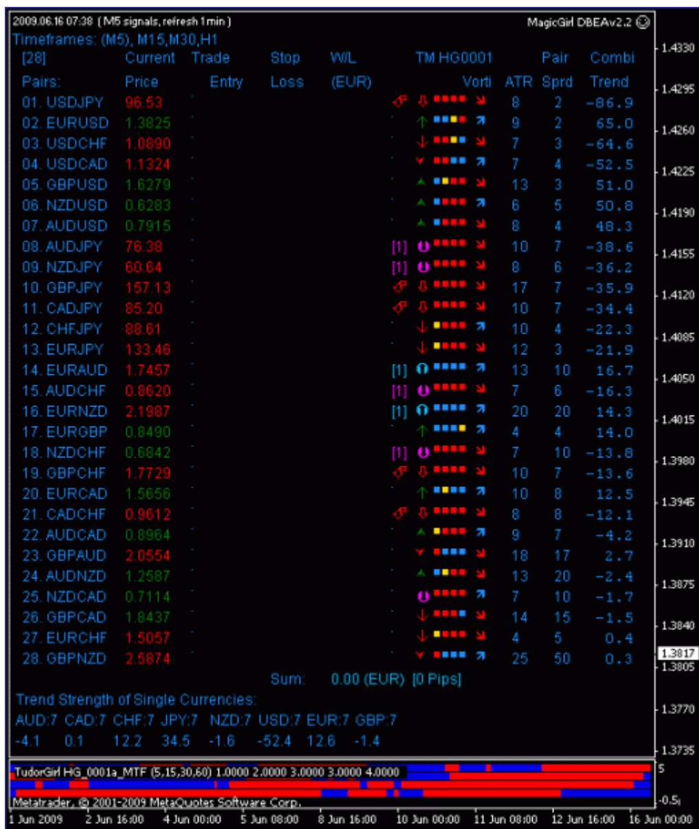
Figure 3: Show the MagicGirl EA v 2.2 dashboard. Note smiley face on Top Right hand corner.