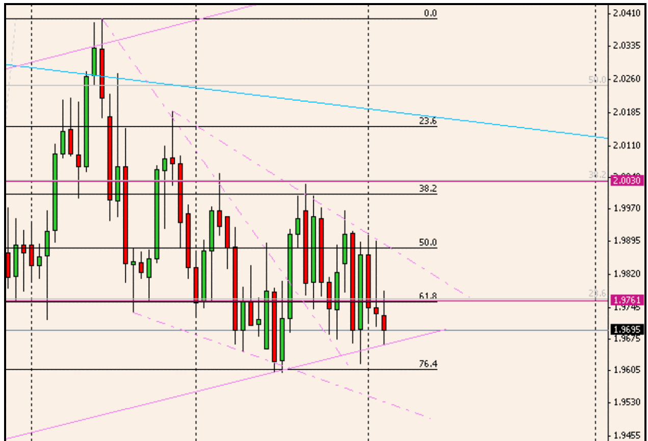
Chart 2 - GBPUSD Daily