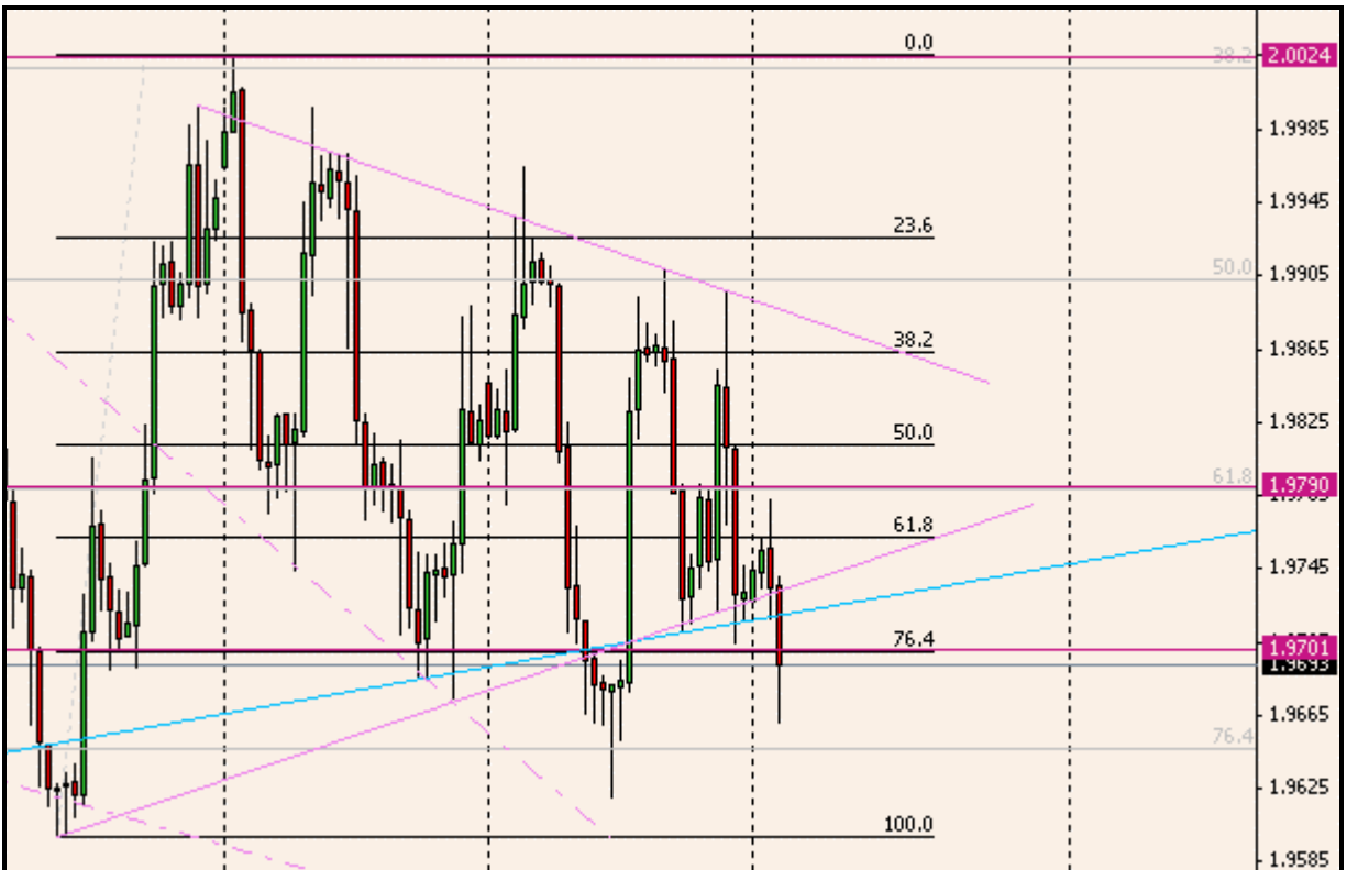
Chart 3 - GBPUSD 4-Hours